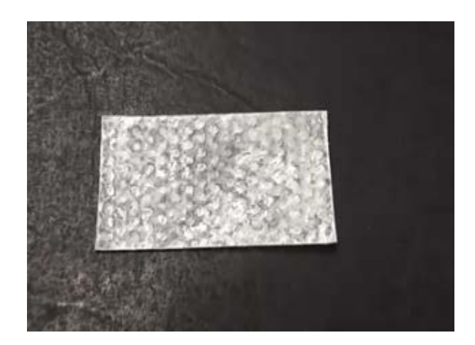
Figure 2: Dental membrane (suitable for guided bone regeneration).

This (polymeric) form of collagen retains its natural cross-linking. Additional crosslinking may be applied to adjust in vivo absorption time. This product is suitable for applications where natural strength is required, such as dental membranes and Bone Graft Substitutes.