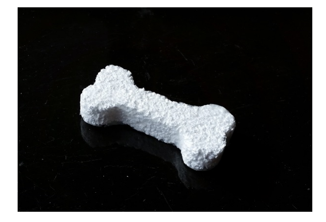
Figure 3: Bone graft substitute (contains osteo-conductive granules in mouldable form).*

*This product is characterized by mouldability and non-shedding of the osteo-conductive granules during moulding. These characteristics are achieved with a low-level addition of Type I polymeric collagen. Collagen Solutions proprietary technology which achieves these ends may be accessed through licensing or OEM manufacture.